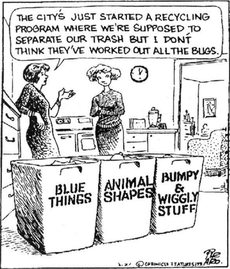
FIGURE 8.2 Sloppy Chunking Leads to Problems King Features Syndicate. Reprinted by permission.

Smart chunking avoids the problems expressed in the Bizarro cartoon shown in Figure 8.2. The bin categories are not sufficiently discrete to enable someone to decide what goes in which container. Can you decide where a blue, bumpy toy elephant belongs? Do you have a clue where a cue ball goes? There are both gaps and overlaps in the bin labels. Worst of all, the categories don't relate to the higher Objectives motivating the project.